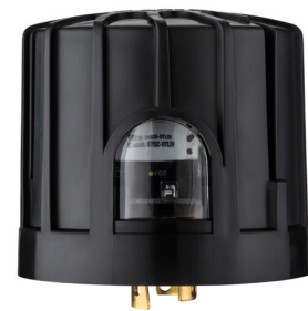
DCC: DTL CONNECT CONTROL

Remote controlled locking type photocontrol